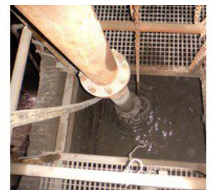
Pump sump with a riser: more than 100 pumps from Tsurumi are used to pump water in the mine Download photo