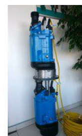
Two pumps of the LH series by Tsurumi in the showroom of the supplying dealer Bilgi from Istanbul Download photo