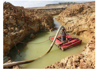
Tsurumi pump in its element: Just 16 pumps keep the Visonta mine with its 4.8 million tons of annual production dry Download photo

Tsurumi is one of the world's most experienced pump manufacturers. From its modern facility in Kyoto, Tsurumi produces more submersible pumps globally per year than any other pump manufacturer. There are currently over 1800 different pump models in the Tsurumi range, including semi-vortex, vortex, non-clog, cutter, contractor & dewatering, sewage & wastewater, aerators & blowers, decanting units and scum skimmers. Tsurumi operates on a worldwide basis with an extensive dealer network in Europe, North and South America, Asia, Australia and parts of Africa.