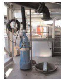
LH430 prior to installation in shaft