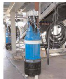
LH837 prior to installation in shaft

προδιαγραφές LH: https://www.tsurumi.eu/el-GR/lh