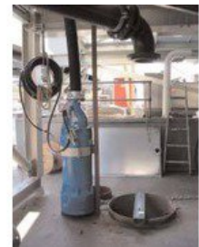
LH430 prior to installation in shaft