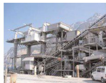
View of the grab dredge plant with parts of the transport system