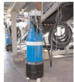
LH837 prior to installation in shaft

Προδιαγραφές LH: https://www.tsurumi.eu/el-GR/lh