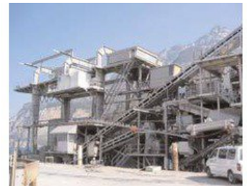
View of the grab dredge plant with parts of the transport system