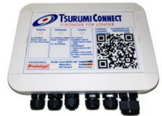
Tsurumi Connect networks all electrical devices at the building site, which helps users save costs

Anything that is useful for the construction management on site is also interesting for the accountants in the headquarters: Invoices can be generated at the push of a button, maintenance intervals can be planned precisely and failure costs reduced to a minimum. The project started last year. There are plans to conclude the field test with 70 devices at the end of the year. Deliveries of the system, which was developed and produced in line with German standards, will start at the beginning of 2020. It also offers real 'plug & play'. The customer does not even need a separate SIM card.